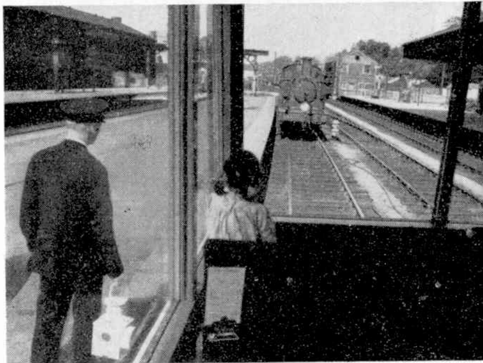
A banking engine approaches the rear of the up Devon Belle at Exeter St. Davids to assist the train up to Exeter Central. The guard has removed the tail lamp from the observation car, through the windows of which the photograph was obtained.

The Devon Belle is the only train that passes Salisbury without stopping. At Wilton—still another "W"—a halt is made, but only to change engines. The