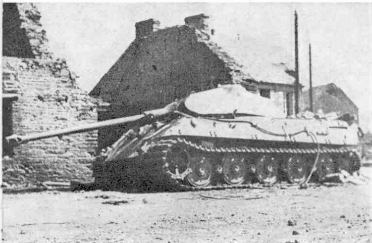
Royal Tiger, knocked out in France 1944. An example of this vehicle is on display at the R.A.C. Tank Museum, Bovington, Dorset