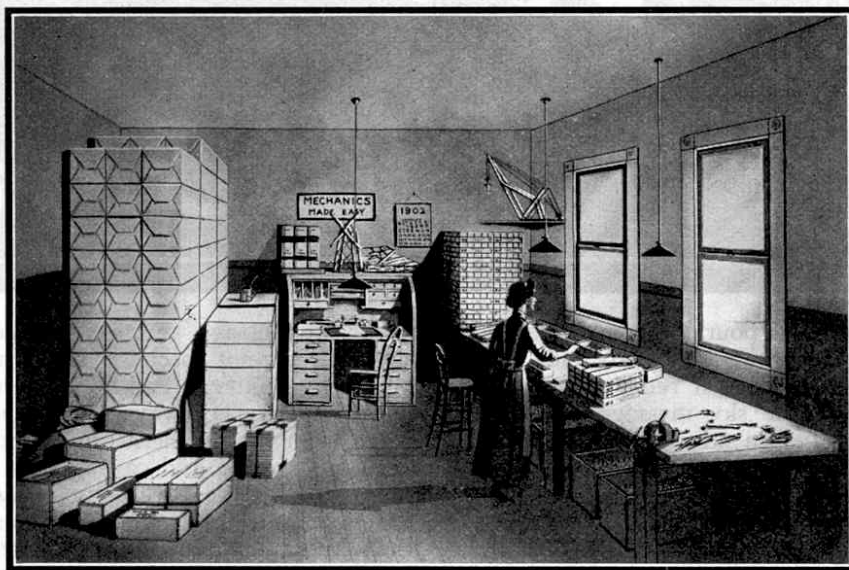
The room in which "Mechanics Made Easy" parts were assembled for packing into Outfits.

I am very proud of these testimonials to the efficiency of Meccano. They show that, although it is primarily a constructional toy, it is based on such sound principles that there are practically no limits to its possible extension. Next month I hope to refer to a few of the most notable instances in which Meccano has proved itself of service.