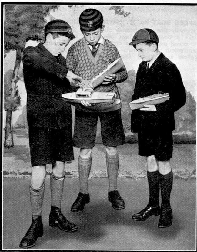
A proud owner demonstrates to his chums the winding of the motor of his Hornby Limousine Speed Boat. The key passes through the roof of the cabin to the winding spindle inside.

The four new Speed Boats that make their appearance this year consist of two smaller boats designed on the same general lines as the No. 3 Speed Boat, but differing in certain details; and two boats of the same size as No. 3, one a Limousine Speed Boat and the other a Cabin Cruiser.