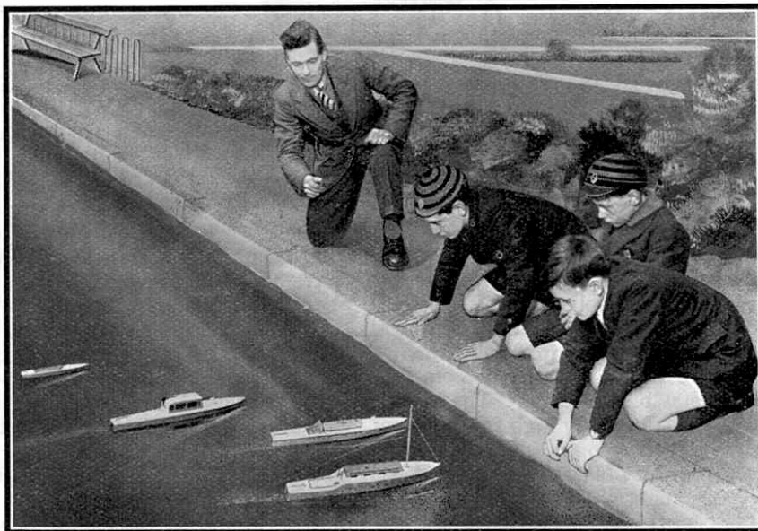
An exciting finish! The result of this race was a tribute to the skill of the handicapper.