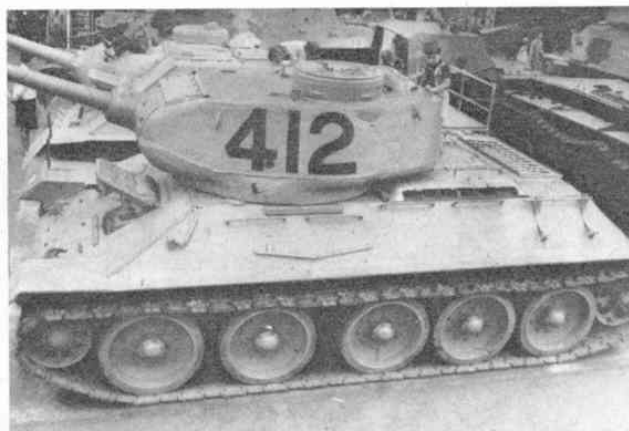
A Russian T34/85 of 1943. This tank was ahead of its contemporaries in having a larger cannon; a diesel engine; very simple construction layout and a very low ground pressure.

The Americans and Japanese were next with this sort of development. The U.S. Ordnance Dept. toughened up a light tank until it became the light-medium M3—known to the British as the "Stuart", or "Honey". It was a very reliable machine, but not as generally useful as the Russian machines. They then toughened up their M2 Medium, which became first the M3 "Grant", and then the M4 "Sherman".