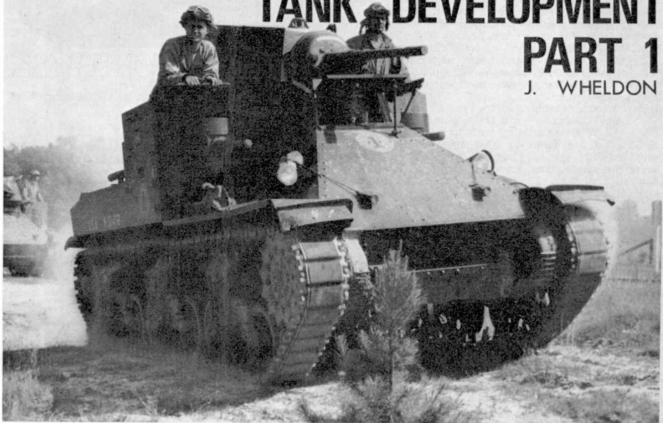
The French "Char B" designed in the mid-twenties, built in the thirties by Renault and used in 1940.