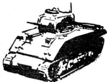
TABLE TOP BATTLES

This is the first of a series of articles which will deal with the building of scale model military vehicles and equipment to form a Wargames Army. Wargaming, apart from being a fascinating hobby in its own right, enables military models to be used rather than stand around gathering dust. Detailed information on military vehicles is not always easy to obtain, but this is no drawback, as Wargames models can be as simple or as detailed as you wish. After all, a real-life general is not too worried about the look of his forces, so long as they win the fight!