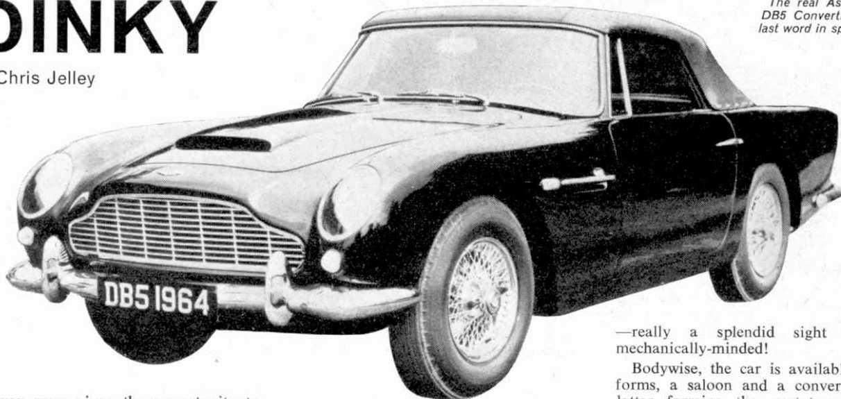
The real Aston Martin DB5 Convertible. "The last word in sports cars!"

If you were given the opportunity to choose a sports car, what car would you pick? No doubt, many of you would choose the small jobs such as the Austin Healey Sprite or the MG Midget, while others would prefer the medium-range cars such as the Sunbeam Alpine and MGB. The 'big' sports, Austin Healey 3000 and TR4, also have a large following, but I think everybody must agree that the 'king' of them all is the Aston Martin DB5.