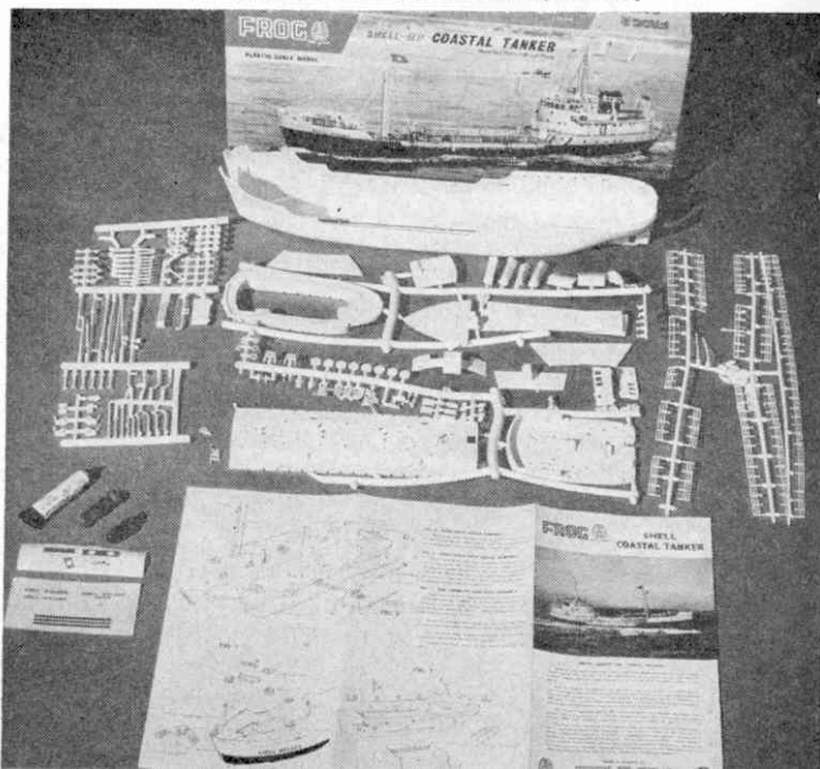
The complete Shell Welder kit awaiting assembly