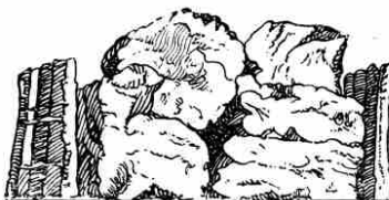
Fig. 1. Method of Constructing Early Breakwater*

At first these took the form of rough breakwaters, which served to break the full force of the waves, and so protected some natural inlet, converting it into a comparatively safe harbour. The first breakwaters were constructed by floating large stones by means of casks to the places required. The stones were sunk between strong oak piles that had previously been driven into the sea floor at