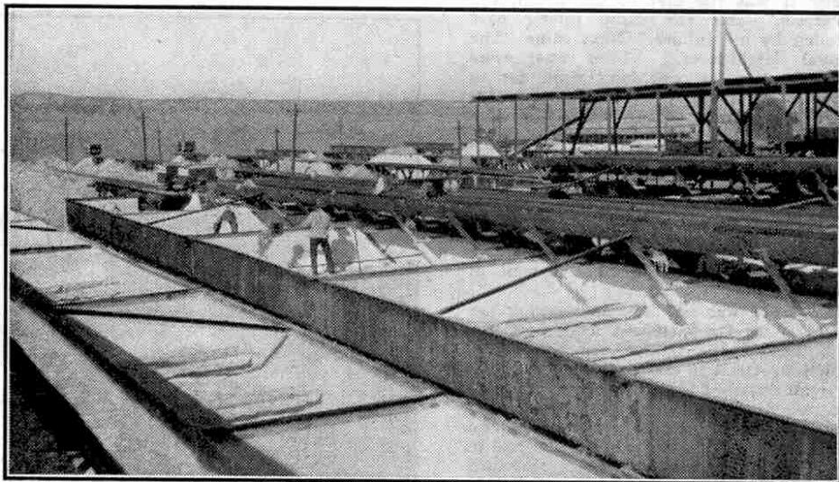
Making preparations to remove Chilean nitrate from the tanks in which it is crystallised.

The nitrate in the desert region is concentrated in a strip of land more than 300 miles in length and 12 to 18 miles in width, where it is hidden beneath two layers, one a few inches in thickness, and a thicker one in the form of a hard rocky mass that can only be broken up by means of explosives. The nitrate or "caliche" bed below these layers is normally white or grey in colour, but various impurities may make it violet, yellow, green or red. It varies in thickness from about 18 in. to 12 ft. or 16 ft., and the proportion of nitrate in it is from about 7 to 80 per cent.