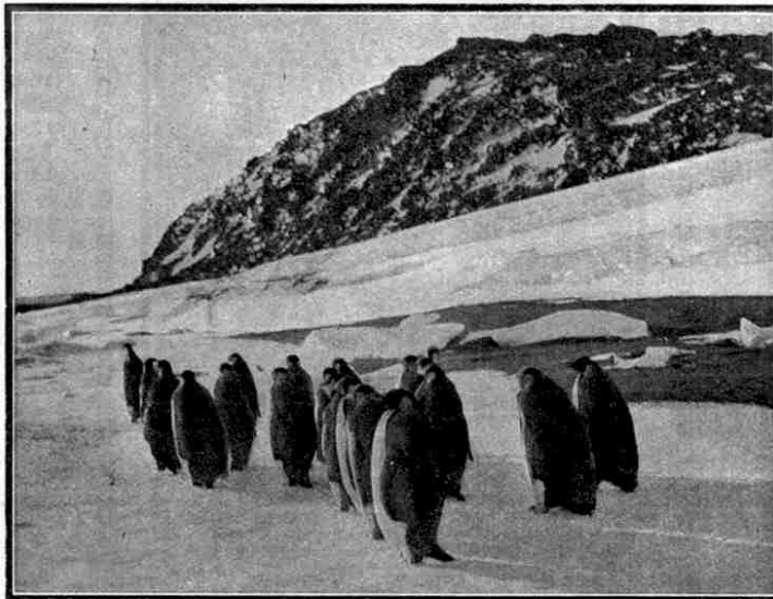
Emperor penguins, the most stately inhabitants of the Antarctic. They are nearly four feet in height and some of them weigh as much as 90 lb. Our photograph is reproduced by permission from "The South Polar Trail," by E. M. Joyce (Duckworth & Co.).