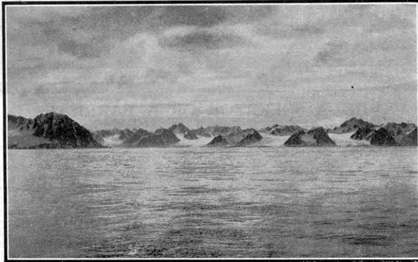
A glacier-fringed coast line in polar regions.

Borchgrevink found that the Great Ice Barrier had changed considerably, and in places its edge was 30 miles nearer the Pole than when Ross had visited it. Soundings showed that the sea was very deep immediately under