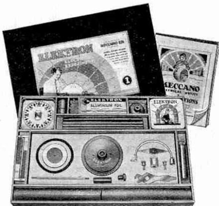
Elektron Outfit No. 1 Price 8/6