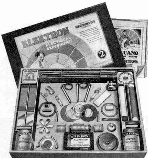
Elektron Outfit No. 2 Price 25/-