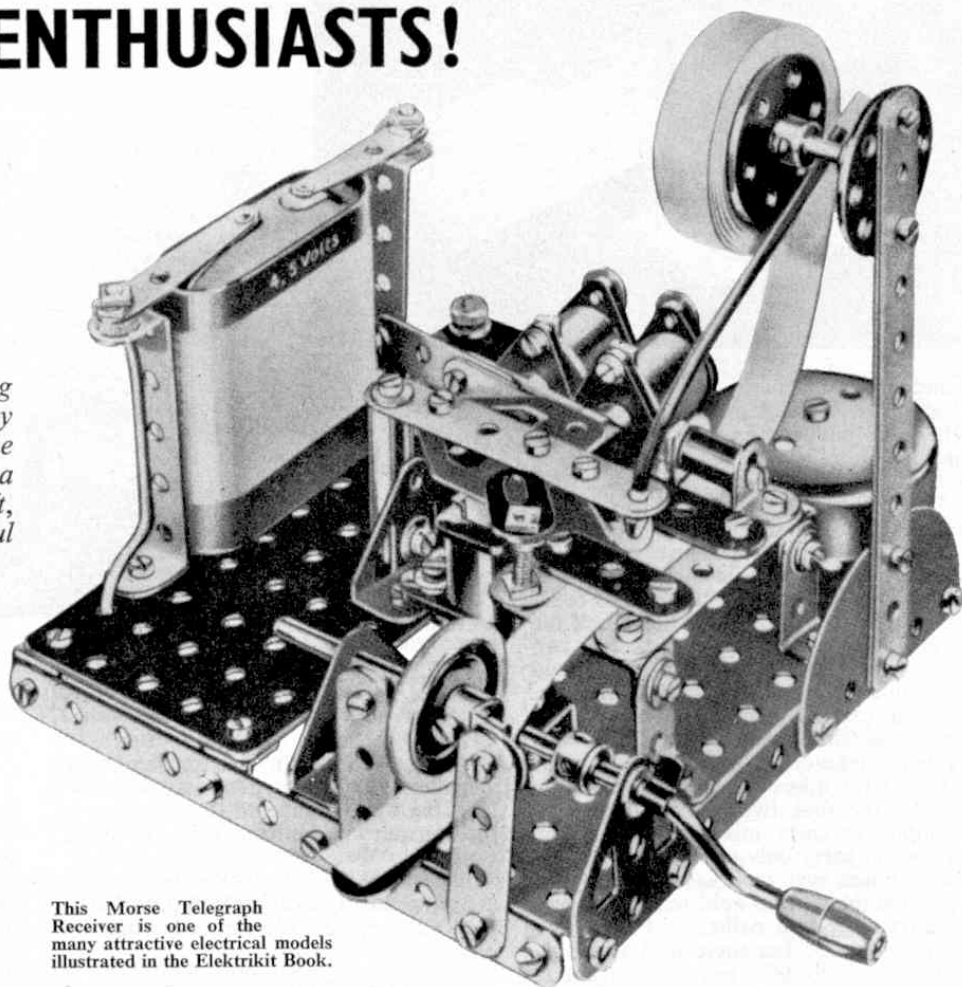
This Morse Telegraph Receiver is one of the many attractive electrical models illustrated in the Elektrikit Book.

Although such incidents as this are common in metal stockyards, shipyards, and other places where cranes are used to lift and transport heavy loads