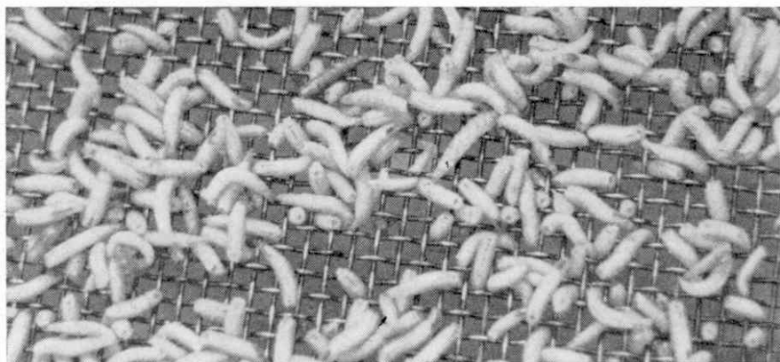
The method used for selecting gentles. Only live ones wriggle through the mesh

A useful sieve for separating maggots from unwanted sawdust can be made from a sheet of galvanise zinc with \frac{1}{8} in. diameter holes. If left on the sieve, the maggots will crawl through, losing much of their grease in the process.