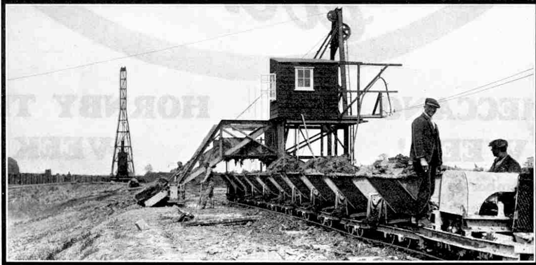
The head carriage of the Henderson Cable Drag-Scraper, with the bucket about to ascend the ramp. The tall structure in the background is a pile-driver. For this photograph we are indebted to the courtesy of John M. Henderson & Co. Ltd.

We hope competitors will pay particular attention to these points as in many recent competitions it has been impossible to illustrate the prize-winning models owing to the unsuitability of the photographs.