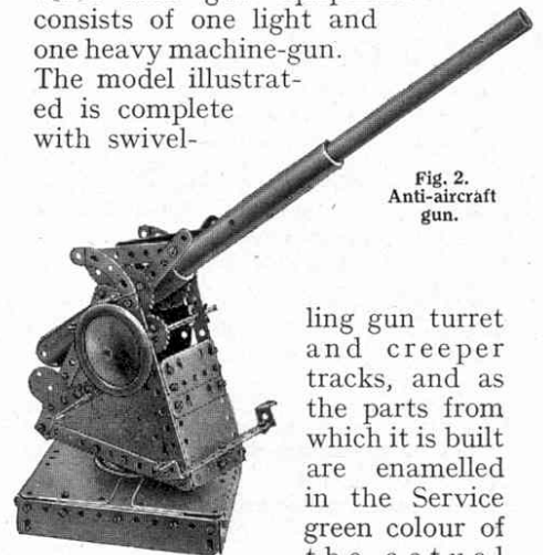
Fig. 2. Anti-aircraft gun.

Remarkably realistic models of tanks can be built from the special parts contained in the Meccano Mechanised Army Outfit, and a good example of these is the "Light" Tank shown in Fig. 5. It is based on one of the latest "Light" units in the British Army, and reproduces closely all the main external features of the actual machine. The "Light" tanks weigh about 5 tons. They are fitted with a 25 h.p. petrol engine and can travel at speeds up to 40 m.p.h., while their gun equipment consists of one light and one heavy machine-gun. The model illustrated is complete with swivel-