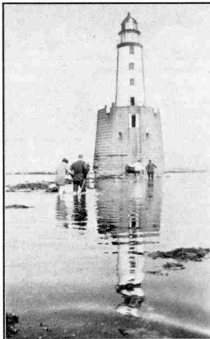
Wading out to Ratray Head Lighthouse, Aberdeenshire.

Once there I had a look round. On the lowest floor in the bell-like foundation of the lighthouse are the compressed air engines that work the foghorns, and also tanks of paraffin for the lamp. Every kind of spare part is kept there too. The engines are run every week without fail to keep them in trim and to reveal any parts that may be faulty. The men live in the narrower part of the tower. I