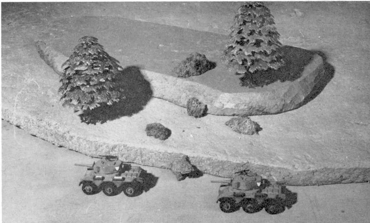
Showing how 'contour boards' can be used to indicate hill levels.