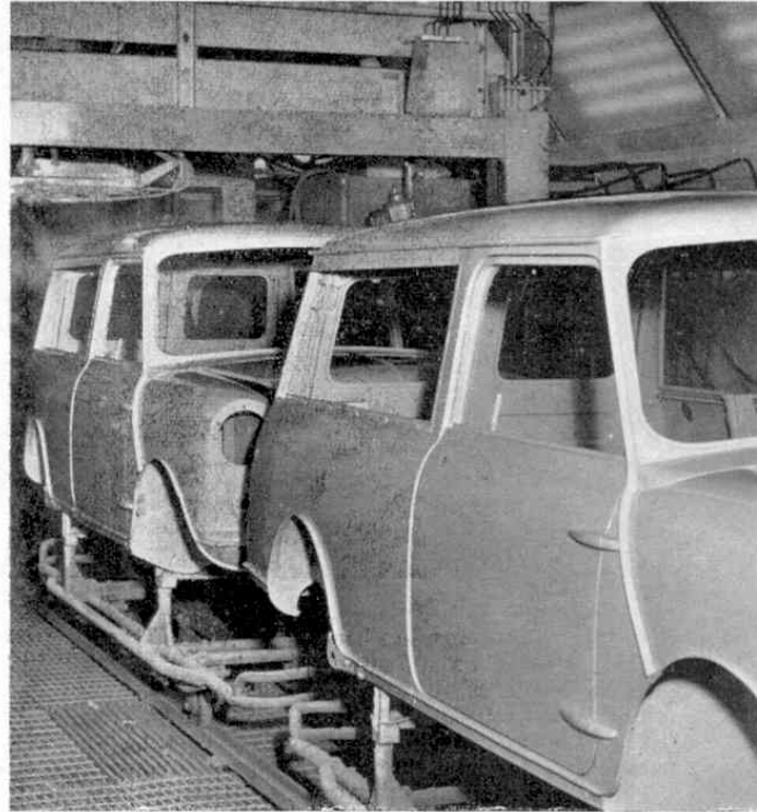
Finishing touches: As in the case of the Dinky Toys model (see picture on opposite page) the actual Countryman gets a final touch-up with a paint brush.