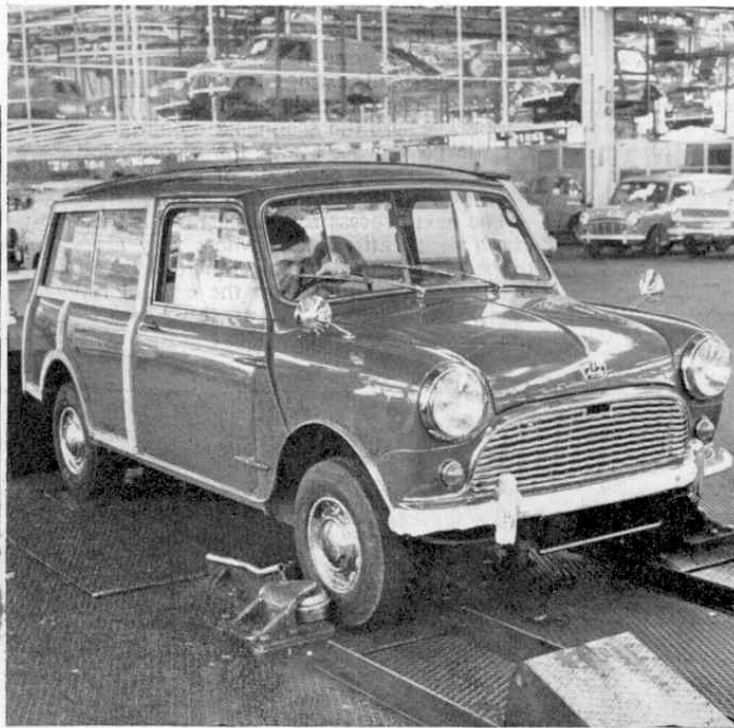
The four photographs on this page and that at the foot of page 170 appear by courtesy of the Austin Motor Company.