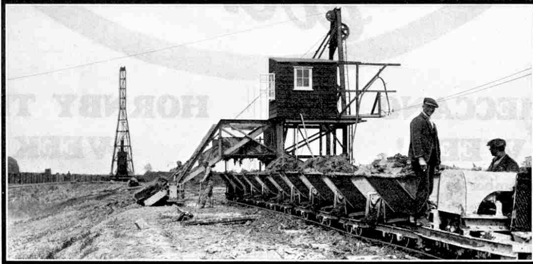
The head carriage of the Henderson Cable Drag-Scraper, with the bucket about to ascend the ramp. The tall structure in the background is a pile-driver. For this photograph we are indebted to the courtesy of John M. Henderson & Co. Ltd.

We hope competitors will pay particular attention to these points as in many recent competitions it has been impossible to illustrate the prize-winning models owing to the unsuitability of the photographs.