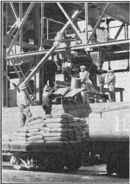
Bagging, sewing and loading granulated nitrate ready for shipment.

More than 91 million tons of nitrate have been produced in Chile since 1830. Naturally there have been fears that the deposits would become exhausted, and as long as 30 years ago the prediction was made that they would be worked out early in the present century. Nature has been bountiful, however, and recent surveys have shown that in the nitrate desert there is enough material to supply the farmers of the world for many generations to come.