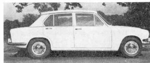
The clean lines of this 'real' 1300 are faithfully reproduced in the latest Dinky model

From the safety angle, safety-belt anchoring points are included inside the car while disc brakes are fitted to the front wheels with drum brakes at the rear. Childproof locks are fitted which is a great asset if young children travel in the car.