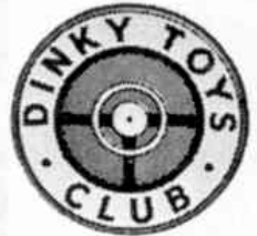
The Dinky Toys Club Badge is beautifully enamelled in colour

ht and enthusiasm which they arouse, it is not surprising that there do for their owners what the Meccano Guild and the Hornby Railway el-building and in the construction and running of miniature railways. new organisation to accomplish this has therefore been created by Mr.