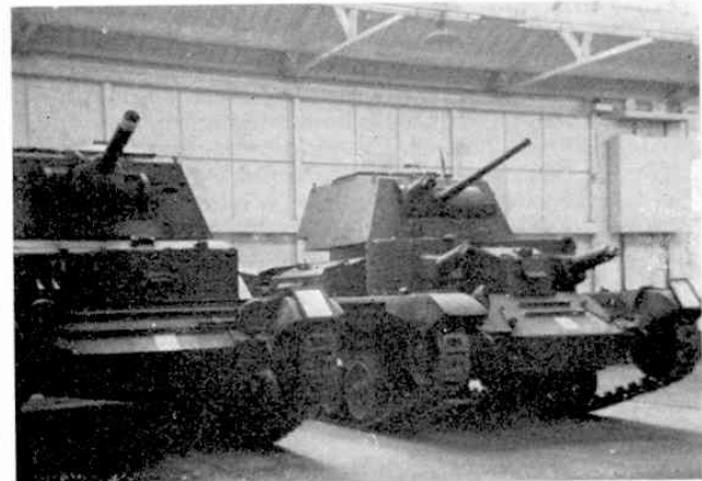
The Bristol Cruiser Tanks (left, A10; right, A9). Both are based upon the inter-war period Vickers designs, surviving in service until 1941. Note sub-turrets on the A9. These were a popular feature on many nations' tanks before 1939. War experience showed them to be excessively vulnerable, and some units used them as storage space. These tanks were said to "bounce like a pea on a drum".

As soon as the effect of the T34 was known in the West, attempts were made to copy it. The Germans began design of the 'Panther', and Hitler ordered a re-hashing of the pre-war heavy designs, which resulted in the 'Tiger', which might be described as a tougher version of the Russian KV.