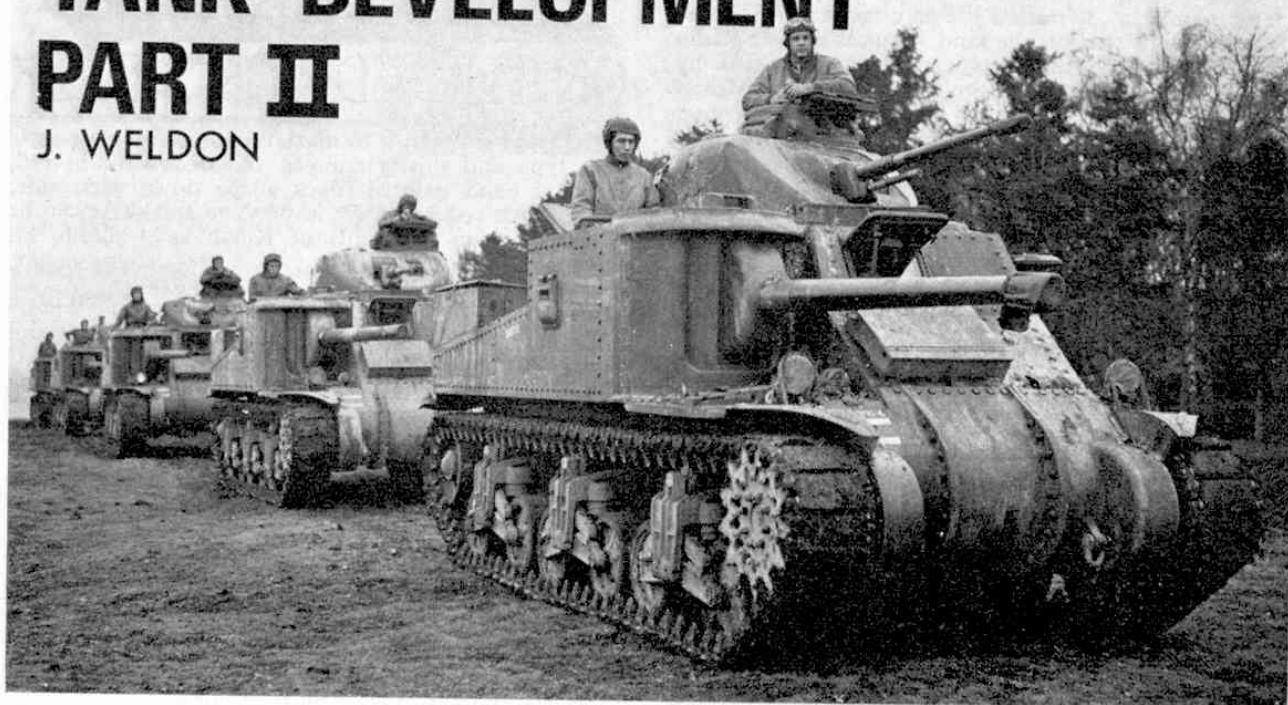
This was the American M3, known as the 'Lee' (American turret) or 'Grant' (British turret). Comparison with the Soviet T34/85 shows it as an inferior machine in that its silhouette is higher; the main armament is not in the turret; construction is by riveting, not cast or welded.