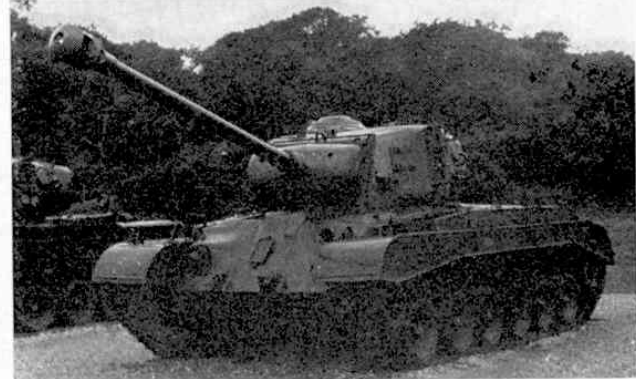
Upper: The "Comet" of 1945—the last of its type. It has grown very like the General Purpose Tank, but is still inferior to the T34/85.