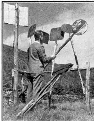
A unique "fire-station" in the Lake District.