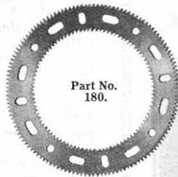
Part No. 180.

No. 180, Gear Ring, 3 1/2" diameter, 95 internal teeth, 133 external teeth. Price 2/- each.