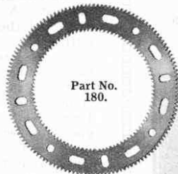
Part No. 180.

No. 180, Gear Ring, 3 1/2" diameter, 95 internal teeth, 133 external teeth. Price 2/- each.