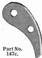
Part No. 147c.

This part resembles Part No. 147a, but is without a boss. The new Pawl can be mounted on a 5/32" Bolt provided with two nuts for fixing it in position.