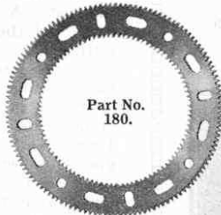
Part No. 180.

No. 180, Gear Ring, 3 1/2" diameter, 95 internal teeth, 133 external teeth. Price 2/- each.