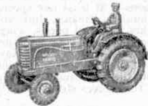
Massey-Harris Farm Tractor, No. 27a.

T RACTORS are steadily increasing in numbers in the countryside, where they are taking over more and more of the work formerly done by horses. They haul reapers, cultivators and other agricultural implements, and they are becoming of greater importance than ever as we struggle towards recovery