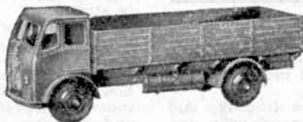
Forward Control Lorry, No. 25r.

Both these new Dinky Supertoys will provide the enthusiast with real fun in manoeuvring. The Articulated Lorry can be backed readily into spaces too narrow for easy entry with an ordinary lorry of the same size, and the Trailer after loading can be hauled out into the most suitable position for picking up when starting on a journey.