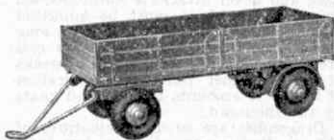
Trailer, Dinky Supertoys No. 551.