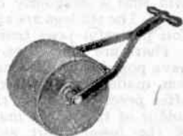
Garden Roller, No. 105a.