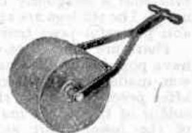
Garden Roller, No. 105a.