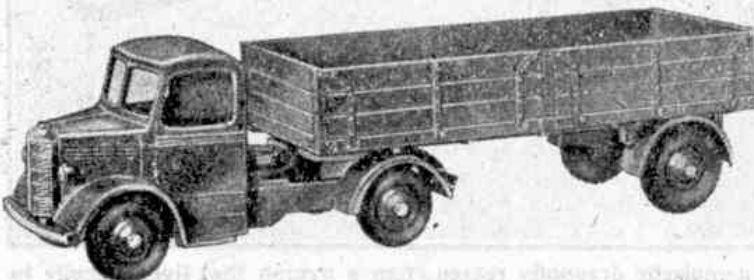
Bedford Articulated Lorry, Dinky Supertoys No. 521.