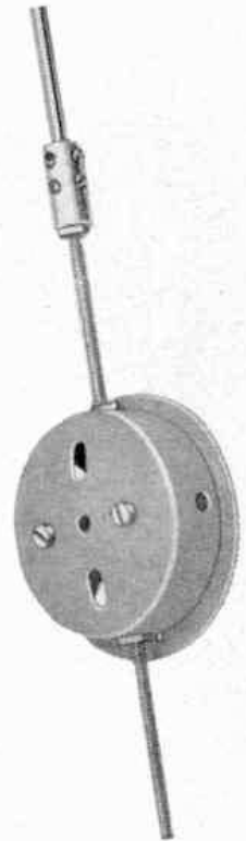
Fig. 2. The Clock pendulum and weight "bob".