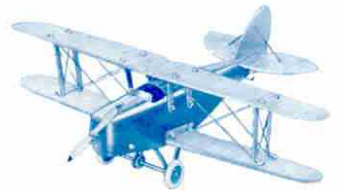
The above illustration shows a model of a Biplane built with Meccano Aeroplane Constructor Outfit No. 0.