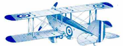
This model of a Standard Light Biplane is based on the type that is generally used for civilian flying. It is a No. 1 Outfit model.