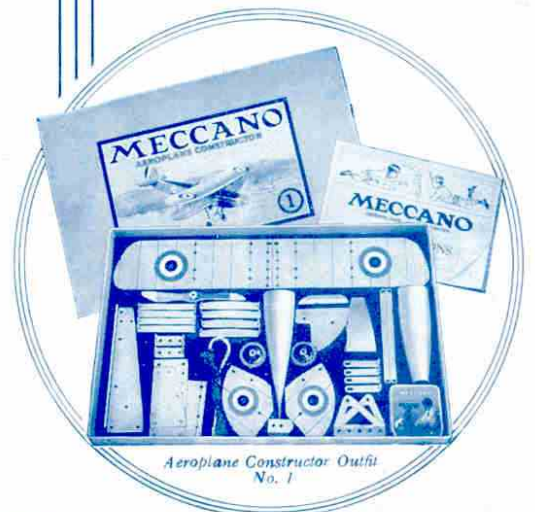
Aeroplane Constructor Outfit No. 1