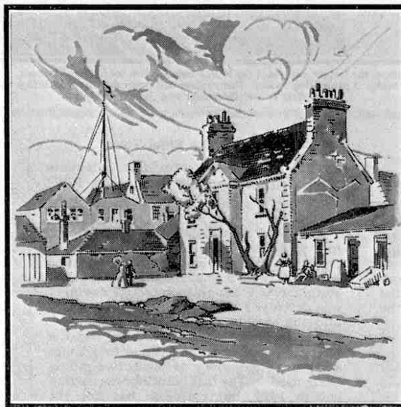
Watt's house in Delffield Lane, Glasgow

This month we commence a series of articles on the Lives of Famous Inventors, on somewhat similar lines to our existing series dealing with Famous Engineers. Almost all great engineers have been inventors to some extent while many inventors have been also engineers, and in many cases it is difficult to decide in which category to place certain men. In the present series, commencing with James Watt, the Father of the Steam Engine, we shall include men whose inventions rather than their engineering work have contributed towards the world's progress.