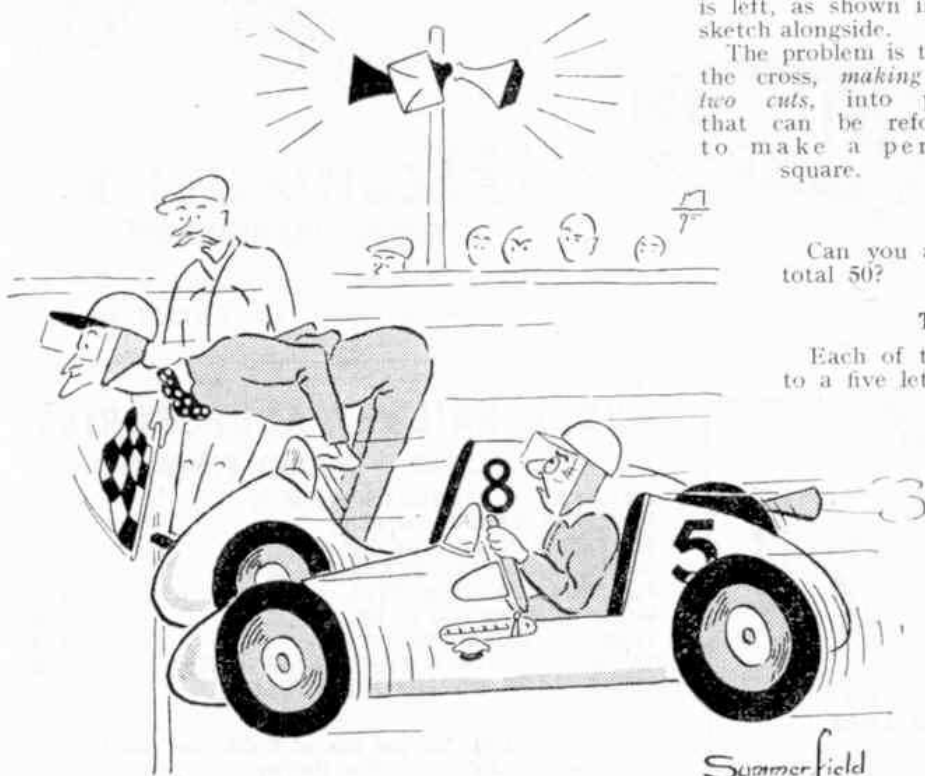
"... No. 8 wins by a neck!"

"Lady," he replied with dignity, "I was a manager of a bath house for ten years and never took a bath."