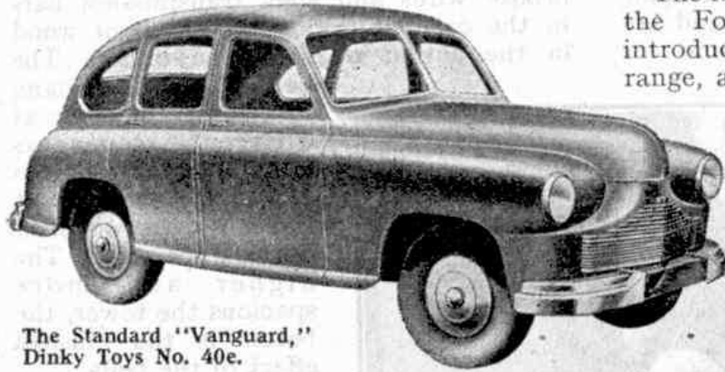
The Standard "Vanguard," Dinky Toys No. 40e.

WITH the coming of the now famous "Vanguard" the Standard Motor Co. Ltd. concentrated on the production of this single model, and other Standard cars have now been dropped entirely. The model is a splendid example of modern