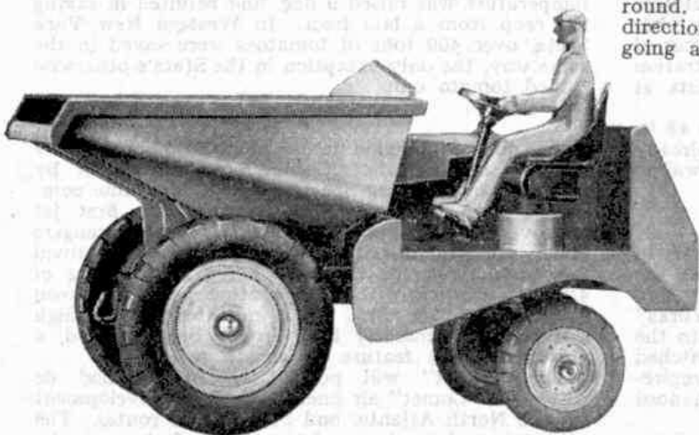
Dinky Supertoys Dumper Truck No. 562, with the driving seat turned for running with the bucket in front.

dumper truck usually has to be backed into position to receive its load or to tip it, and to ensure that this can be done easily and with certainty the driving seat is made so that it can be turned completely round. The driver in fact looks naturally in the direction in which the truck is moving, whether going ahead or astern, and driving backward is as easy and certain as driving forward.