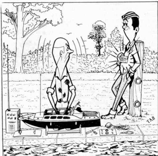
" Good afternoon gentlemen, here is the shipping forecast for today Saturday the . . . "