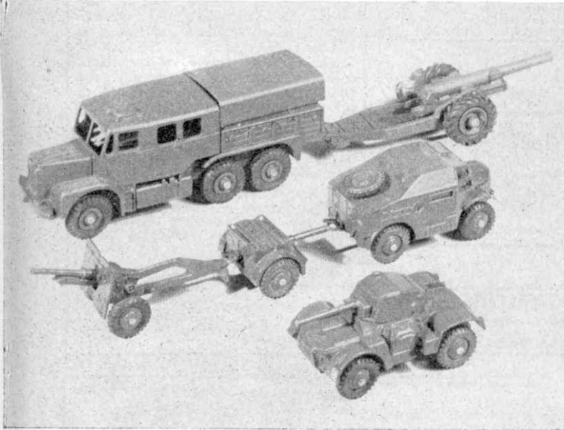
Examples from the 'army' section: from the back, No. 689 Medium Artillery Tractor, No. 693 7-2" Howitzer, No. 686 25-pounder Field Gun, No. 687 Trailer for 25-pounder Field Gun, No. 688 Field Artillery Tractor, No. 670 Armoured Car.

You must also remember that the range of available models does not remain unaltered for long. New miniatures are constantly being introduced and old ones withdrawn. Try to get those that you think might quickly disappear from the market because, once a Dinky has been withdrawn, there is little chance of it being re-introduced.