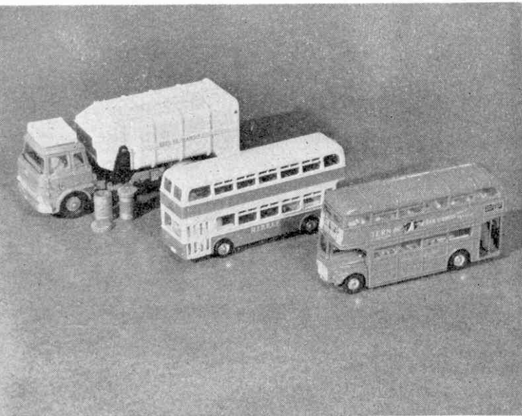
The 'public service' group includes, not only buses, but anything that performs a public service. Here we have No. 978 Refuse Wagon, No. 292 Atlantean Bus and No. 289 Routemaster London Bus.

Dinky Toy collecting can be a serious business and very enjoyable if you decide to build 'theme' collections. However, before you decide to embark on series or theme collecting, much careful thought must be given to the matter before you actually start buying. It is not advisable to draw out all your pocket-money and go charging down to the nearest model shop to buy everything in sight. If you did this, you would soon be in financial difficulties. There are more than 150 models in the current Dinky range, varying in price from 3s. 0d. to almost 30s. 0d., which will give you some idea of how much