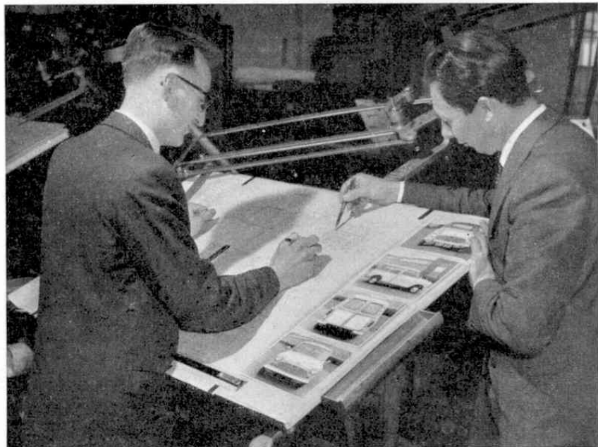
A discussion on the Austin Seven Countryman in the Drawing Office at the Binns Road Factory of Meccano Limited (top picture). Below: The patternmaker at Binns Road prepares a wooden model of the new vehicle.

What lies behind the planning and the making of a new Dinky Toys model? In this article The Editor takes the reader through the detailed steps which are necessary before a new Dinky Toys miniature can find its way into countless thousands of homes throughout the world.