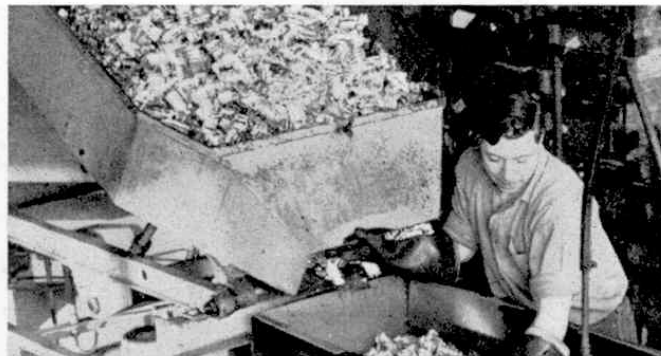
Above: The toolmaker at work. In the lower picture you see hundreds of metal castings of the new model going through the separator.

Let us pursue further the specific example of the Dinky Toys model of the Austin Seven Countryman. While plans are being drawn of the car body, fully-dimensioned drawings have also to be prepared of the base, which carries the wheels and the arrangement for springing and "finger-tip" steering, and the interior of the car, which must accommodate seating, dashboard, steering wheel, etc.