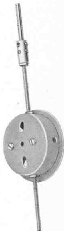
Fig. 2. The clock pendulum and weight "bob."

The pallet is a 2\frac{1}{2} " x \frac{1}{2} " Double Angle Strip 27 bent to the shape shown in Fig. 4. It is attached by a bolt to a Collar on a 3\frac{1}{2} " Rod 28, mounted in the Triangular Plates and the lower holes of Strips 10. Three Washers