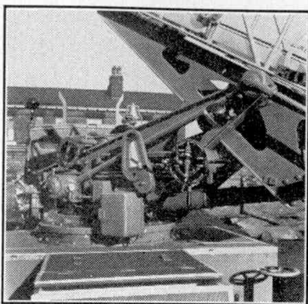
The operating controls of the Morris turntable fire escape ladder. In the centre is the special indicator that automatically stops operation when the ladder has been extended to its safety limit.

One of the most remarkable of these safety devices prevents the ladder from being extended beyond the safety limit at its various angles of elevation. This is an electrical installation that is governed by what is called the "field of operations indicator," which can be seen in the centre