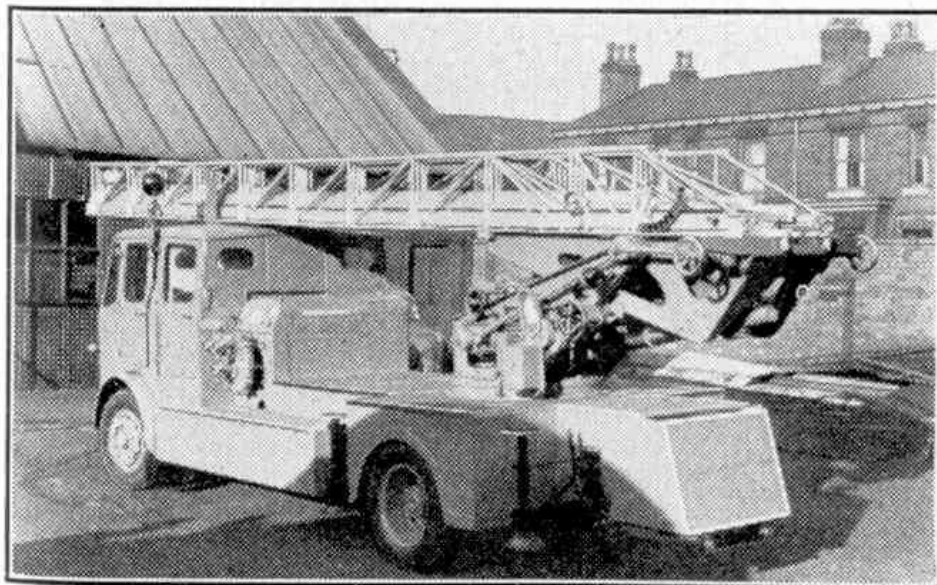
The new Morris fire escape on a Leyland Beaver chassis.

Behind the driver's cab is a compartment to seat a crew of four, and at the sides and rear of the platform are lockers in which hose, unions, tools and other equipment are stored. A self-contained Coventry Climax pump with a capacity of 350-500 gallons a minute is mounted amidships on the platform.