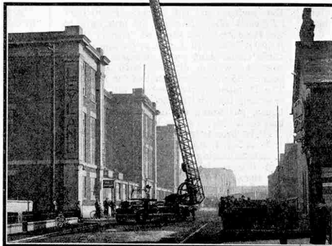
The ladder extended to its full length. It is in five sections with a total length of 132 ft., but similar escapes may have ladders up to 160 ft. long.