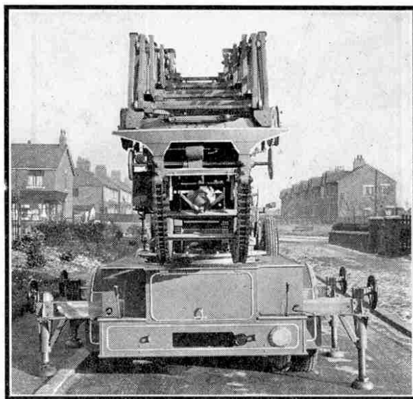
When the ladder is to be raised and extended, jacks on outriggers are lowered in order to give stability to the escape.