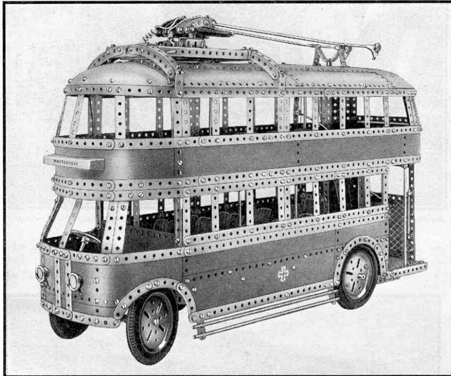
A fine trolley bus in Meccano. It runs in a most realistic manner on current taken from overhead wires.

The trolley arm frame consists essentially of two curved girders built up from a number of short Angle Girders and Curved Strips. These two members are connected together by four 7\frac{1}{2} " Angle Girders supporting the trolley pivot frames. Each of these pivot frames is constructed from 1\frac{1}{2} " Angle Girders, and one complete frame is insulated from the remainder of the model. A short Rod carried in each pivot frame has at its upper end a Coupling that is fitted in its longitudinal bore with a 2" Rod. It carries also at each side a 2\frac{1}{2} " large radius Curved Strip, these two Strips being fitted at their outer ends with a Coupling supporting one of the trolley arms. The inner end of each Curved Strip is fitted with a strong spring, the opposite end of which is secured to the 2" Rod already mentioned. These springs always tend to keep the trolley arm in a raised position. The trolleys consist of \frac{1}{2} " Pulleys each of which is mounted in a frame built up from sheet metal.