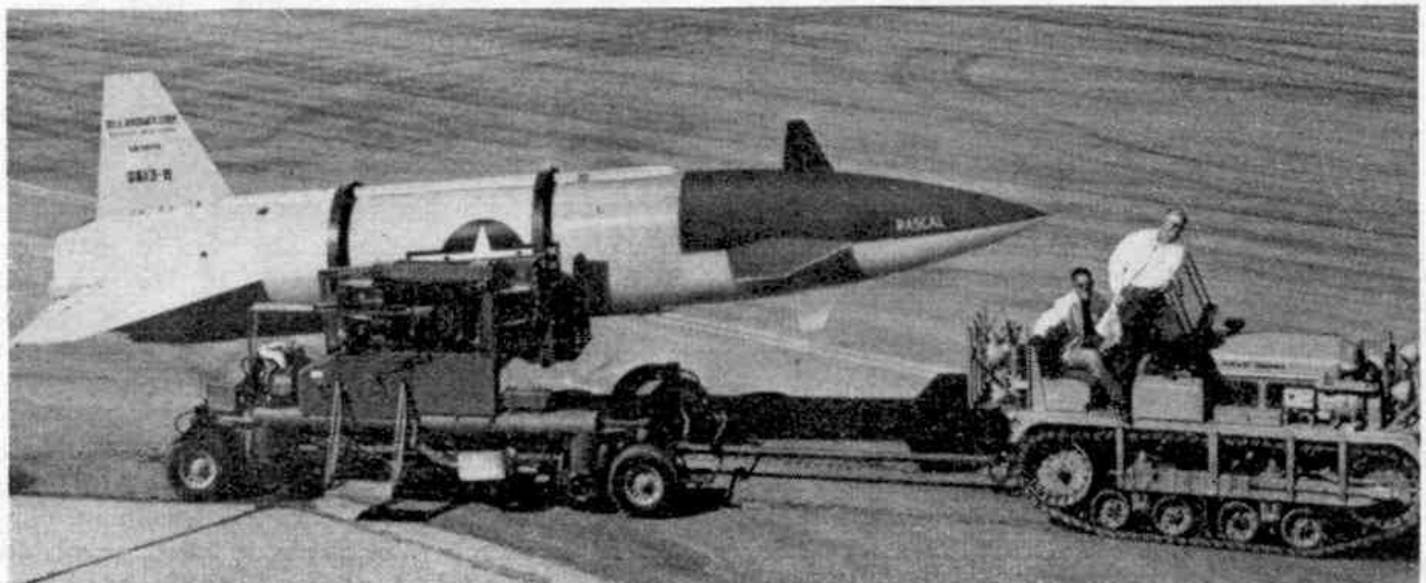
A Bell Rascal powered bomb is here shown secured to a ground-handling trolley for transport across the airfield.

B.O.A.C. have ordered, from Vickers, 35 VC10 jetliners for delivery in 1963. Each will have four Rolls-Royce Conway turbojets and will be employed on the Corporation's African, Far East and Australian services.