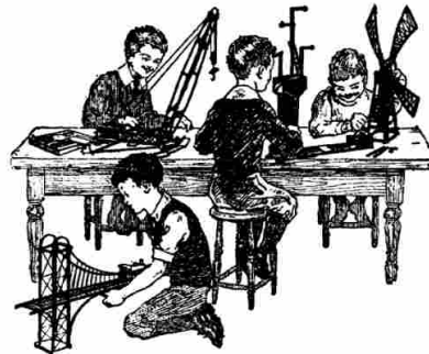
A BUSY MECCANO CLUB.