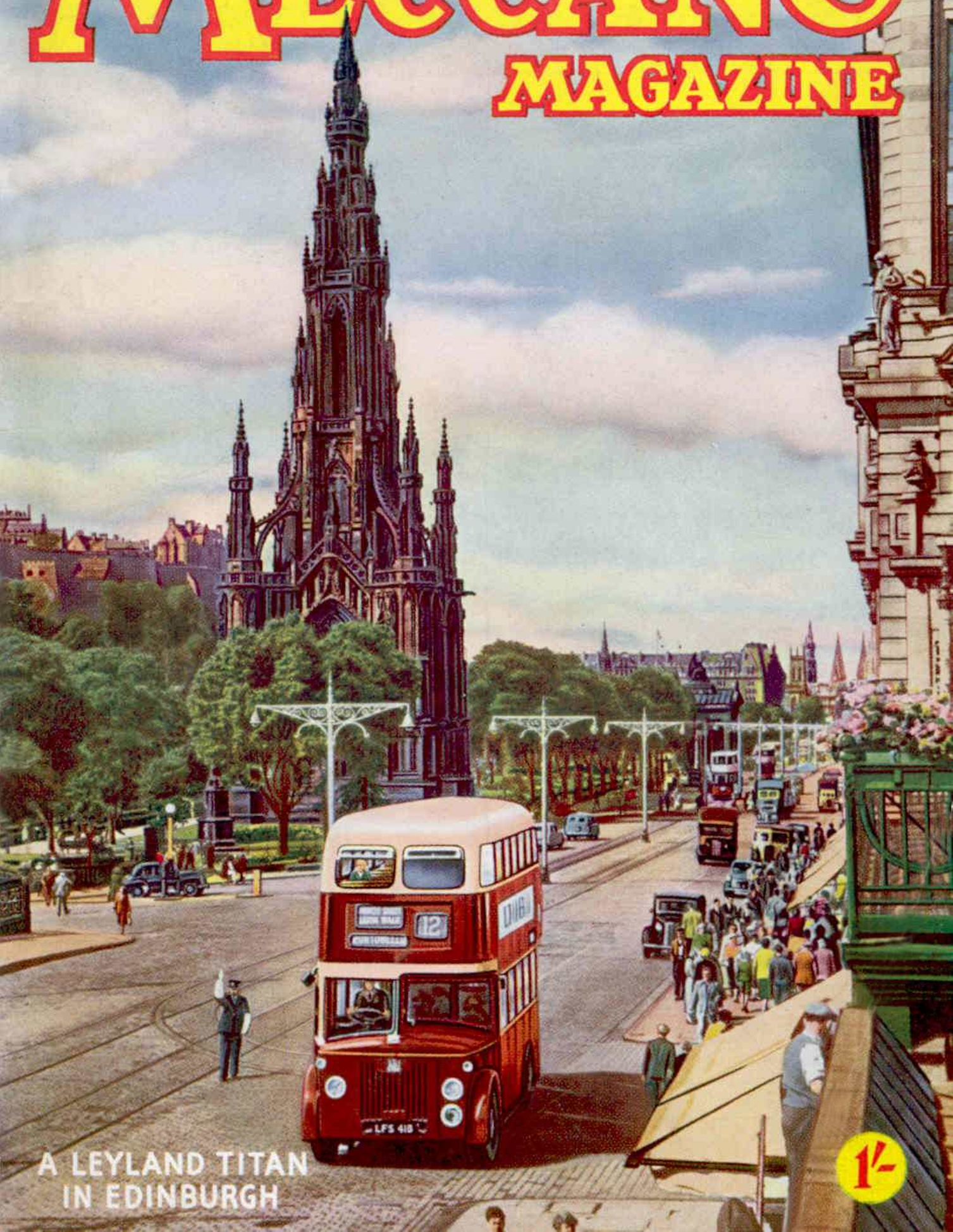
A LEYLAND TITAN IN EDINBURGH