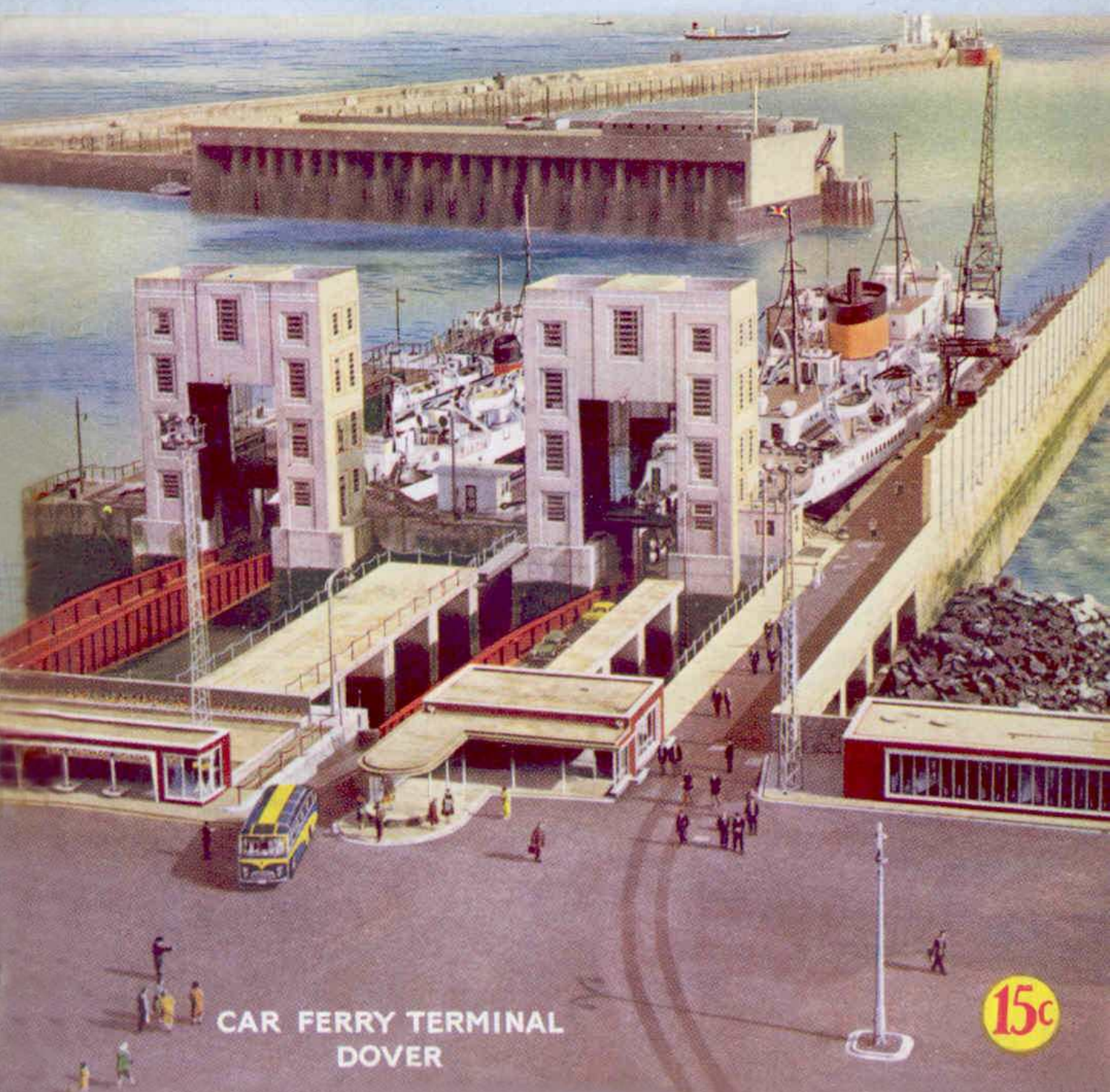
CAR FERRY TERMINAL DOVER